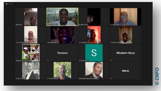
Participants and facilitators attending a session of CNFO's Virtual Leadership Institute

Further discussion continued for the remainder of the module around questions posed by participants to the instructor. Two women and 6 men representing fisherfolk organisations (FFO) or cooperatives in Antigua and Barbuda, Anguilla, Turks and Caicos Islands, Saint Lucia, Grenada, Trinidad and Tobago and Guyana, and holding leadership positions, as well as FFO members and mentors participated in the training module.