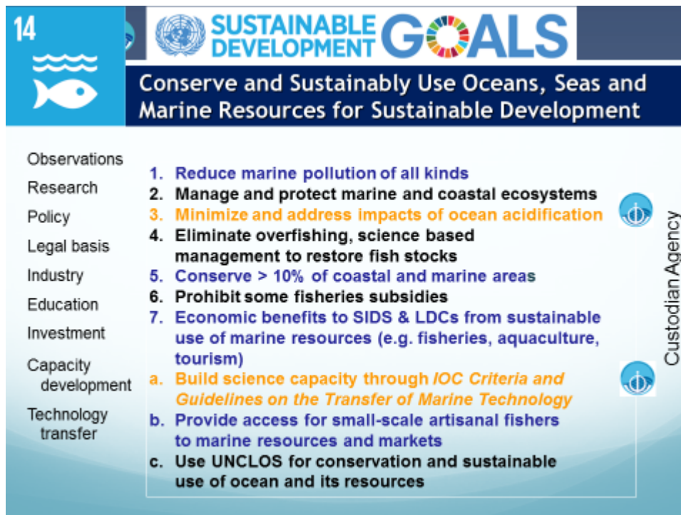
Figure 2. Sustainable Development Goal 14

The IOCARIBE SSP will be implemented via regional efforts coordinated through the Secretariat and following the actions adopted by the statutory meeting and the guidance of the officers. The SSP will be briefed to leaders in member states and regional organizations as way forwarded to a comprehensive regional ocean and coastal science effort. These efforts are supportive of Sustainable Development Goal 14 as can be seen in Figure 2.