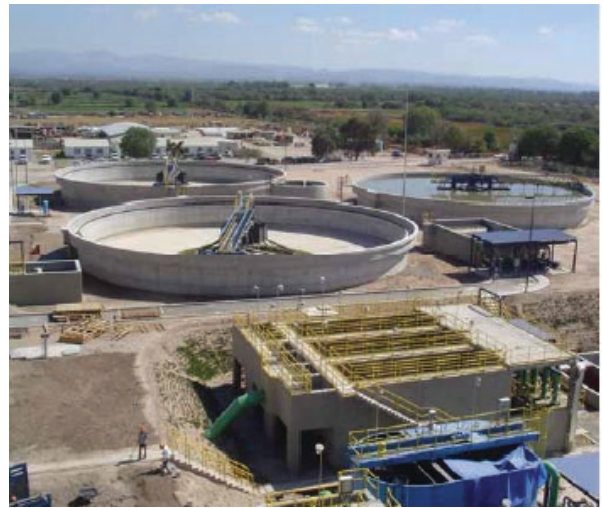
PHOTO 1. Tenorio Wastewater Treatment Plant

To protect the aquifer and to promote the use of wastewater for nonpotable uses such as for agriculture and industry, the state government implemented an Integrated Plan for Sanitation and Water Reuse. Since then, seven wastewater treatment plants have been built in the region, treating most of the wastewater from the metropolitan area and reusing 100 percent of the wastewater treated. The innovative water reuse contracts and agreements with different