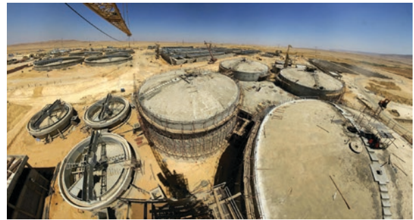
PHOTO 1. New Cairo Wastewater Treatment Plant

The city of New Cairo was one of the newly planned urban areas. New Cairo was expected to grow from a population of 550,000 to approximately 4 million by 2026. The existing infrastructure could not support