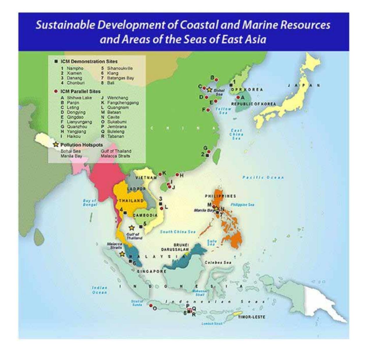
Figure 3 PEMSEA Sites for ICM