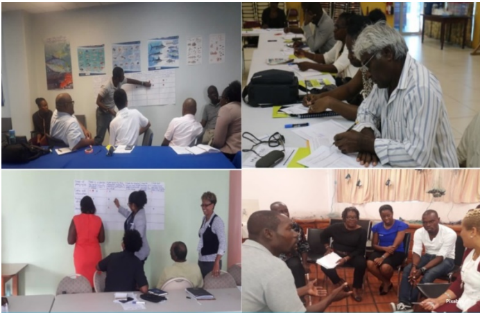
Figure 2 Stakeholder consultations in revising the ECFE FMP

Stakeholder involvement (e.g. figure 2) was expected to take place through the implementation of the project activities. Periodic reviews, and, whenever applicable, revisions of the stakeholder involvement plan would take place during project execution under the concept of adaptive project management.