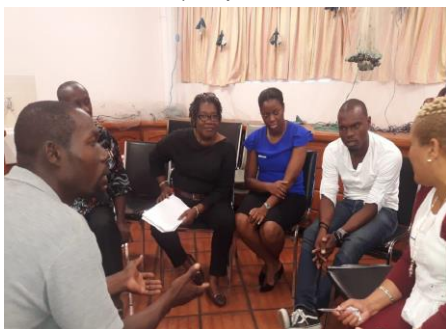
Participants at one of the mini-consultations held in Barbados.