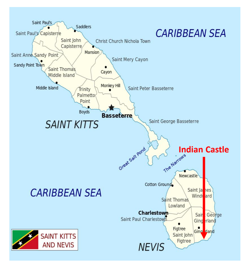
Map: Location of ICFFA's operation in Nevis