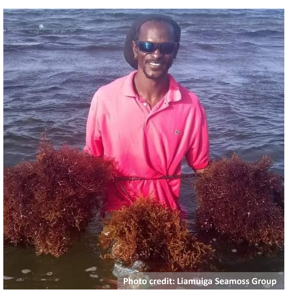
Image: Liamuiga Seamoss Group member harvesting Seamoss from their seamoss farm