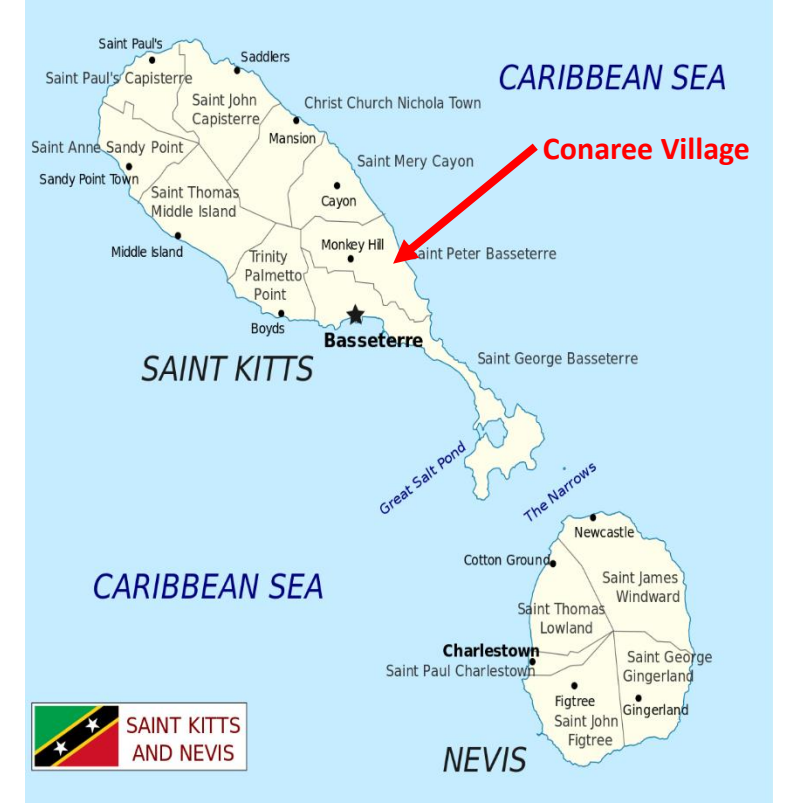
Map: Location of the Liamugia Seamoss Group's operation in St. Kitts