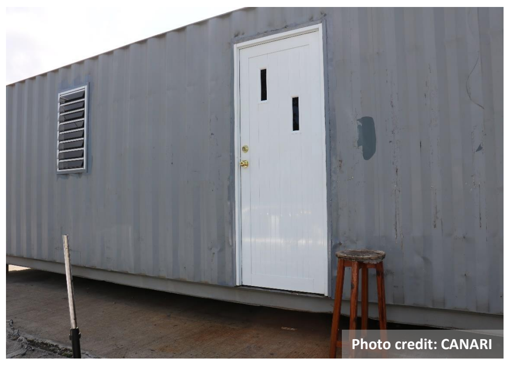
Image: New processing facility constructed by the Liamuiga Seamoss Group