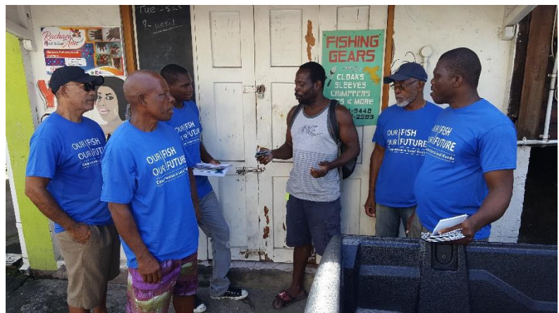
Members of the Gouyave Fishermen Cooperative Society speaking to a member of the public on the as part of their awareness campaign "Our Fish, Our Future".