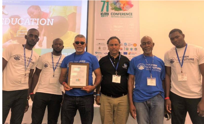
A member of the Gouyave Fishermen Cooperative Society accepting his fisherman's award at the Gulf and Caribbean Fisheries Institute Annual Fisherfolk Forum.

The creation of a marine protected area was proposed to mitigate against and adapt to climate change while also attempting to reverse the depletion of the fish population in the nearshore ecosystem in Gouyave. The Gouyave Marine Protected Area (GoMPA) is comprised of five zones: a fish sanctuary, an anchoring zone, a beach seine fishing zone, a reef fishing zone and the rest of the area protected within the MPA boundaries. The GoMPA covers 5.4 km 2 of the nearshore environment of the west coast of Grenada, most of which is less than 40 m in depth. The fish sanctuary, a no-take zone within the boundaries of the MPA, covers an area of 23.8 hectares (0.238 km 2 ) (Campbell, 2018).